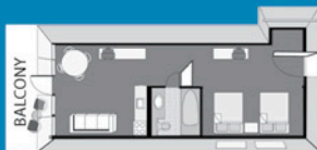
OCEANFRONT 2-ROOM SUITE